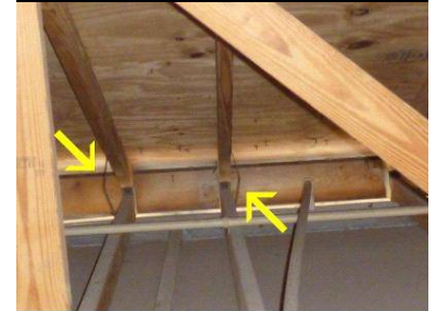
Truss strap slack