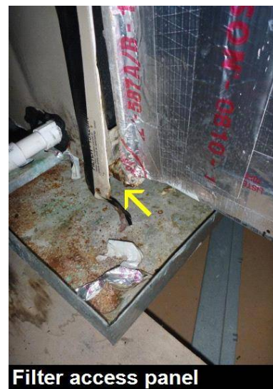
Filter access panel

closure and mechanical application requirements of §13-610.1.ABC.3.1.