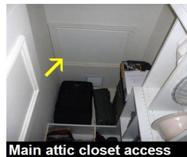
Main attic closet access

Evidence of prior critter activity was noted. This evidence includes furrows in various areas of the blown insulation and animal waste. Recommend removing animal waste and contaminated insulation. The source of critter entry should be located and sealed. The most likely source of entry is the gaps between soffit panels and roof covering, as noted below.